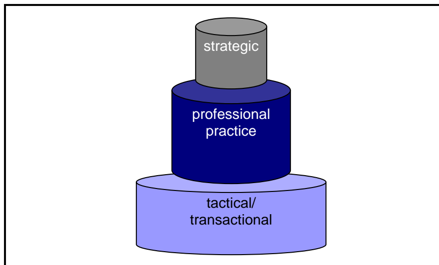
Figure One: Division of roles within each functional management area

Second, the committee recast the proposition of the MSO itself. Rather than being a means to reducing costs, the whole effort was presented as a means to reduce risk and improve talent management in the functional areas. Operational efficiencies might well result and, over the longer-term, at larger scale, they could produce cost savings. Yet, that was not the focus of the initiative. Third, the committee provided two options for MSO implementation. The first, “steady-state” model focused on the implementation of one functional area at a time and allowed for a highly controlled, orderly implementation of a full-scale MSO (See Figure 2):